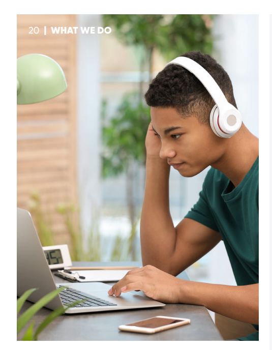
Young player completing the online course